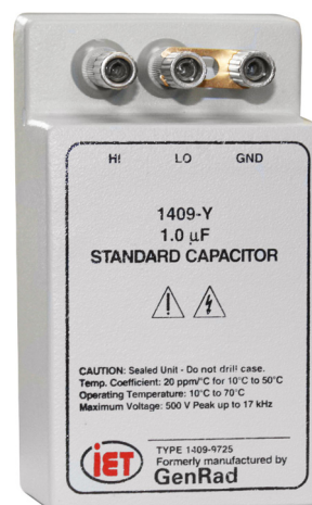
Figure 1-1: 1409 Series Capacitance Standard

A well is provided in the wall of the case for inserting a dial-type thermometer. For convenient parallel connection without error, three jack-top binding posts are provided on the top case, with removable plugs on the bottom.