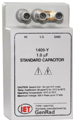
Figure 3-1: 1409 capacitor standard Figure 3-2:

1409 capacitors have 3 binding posts -- HI , LO , and GND -- as shown in figure 3-1.